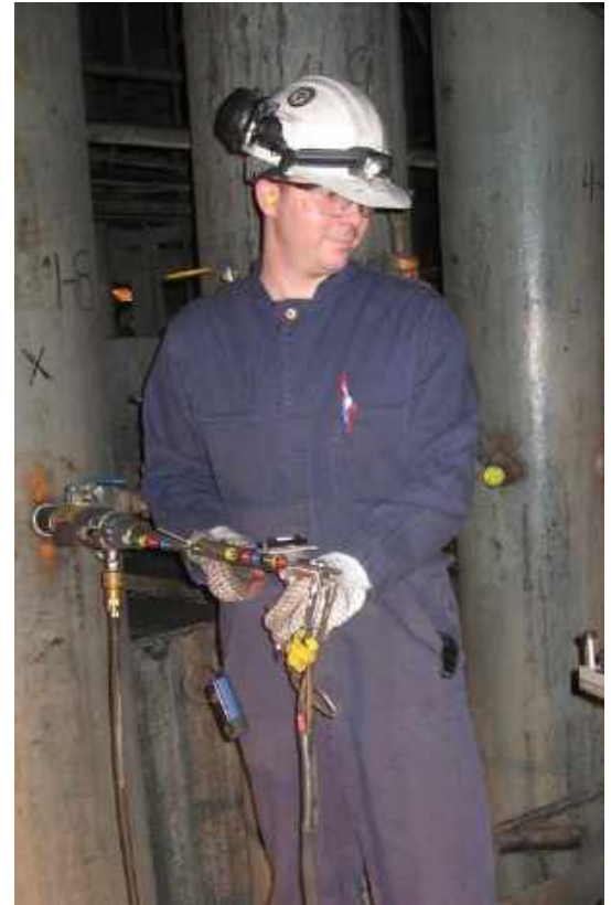
Velocity testing in a coal piping system

The Dirty Air Pitot Test System by Airflow Sciences Equipment, LLC (ASE) provides all the basic equipment needed to measure air velocity, pressure, and temperature.