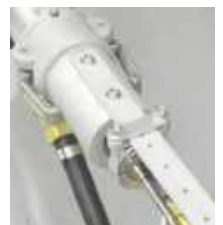
DAP with Fast-Lock

An upgrade from the standard Dustless Connector and Mobile Seal Air Fitting is the Fast-Lock system. In addition to providing seal air and a Traverse Rod, the Fast-Lock system speeds the testing process by allowing a quick connection to the Dustless Connector. A short turn of the Fast-Lock handles automatically connects and aligns the probe. The Fast-Lock system is optional on the DAP (part no. DAP-FL), but is standard equipment on ASE's automated and motorized coal sampling probe, the ISO9931-APA.